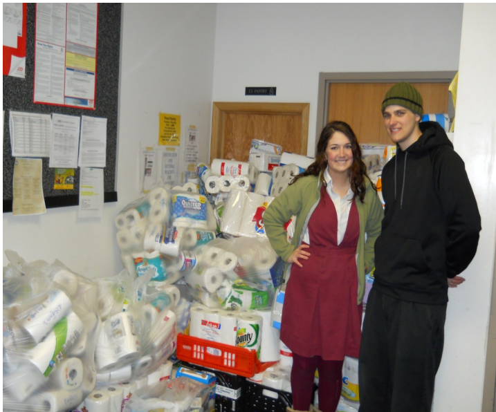
Bishop Watterson did a huge and badly needed paper product drive