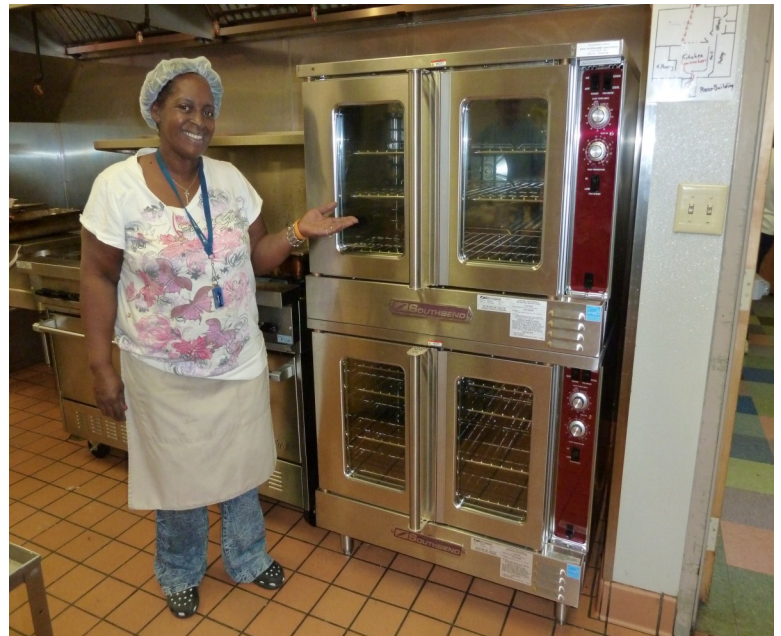
Peppy is very happy with her new oven!!!

There are so many more that deserve our thanks. We don't have room on paper, but we do have room in our hearts to thank you!